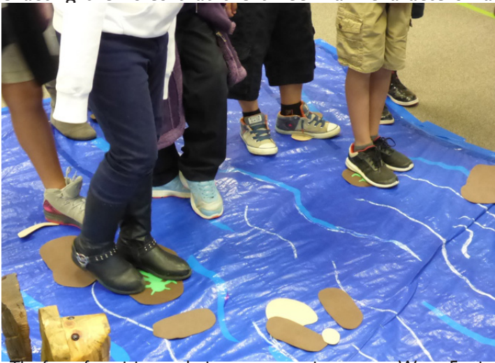
The feet of participants during a conservation game at Water Festival

in the stream, students learn how each one interacts with and is dependent upon the other and how each of the life cycles overlap and benefit the others. Most importantly, the crucial role that cold, clean water plays in the survival and well being of all the stream creatures is emphasized. A brief discussion follows to point out what all of us can do to help conserve water and insure a flow of cold, clean water in our streams. Each student in each class participates in the sometimes chaotic scenarios. This year 364 students and 16 teachers “got their feet wet” in our simulated stream.