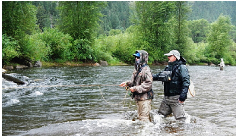
Rain or shine..real fishermen!

RMF's (7th annual) Youth Day Camp schedule has been finalized...and it's time for volunteer instructors and mentors to sign up. Your earliest possible volunteer response will be important, to make up for the several weeks delay this year. A PDF of the camp schedule can be downloaded from our web site .