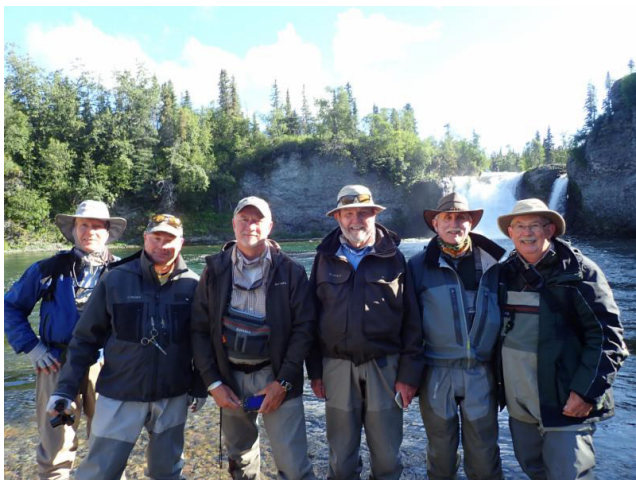
Rocky Mountain Flycasters in Alaska