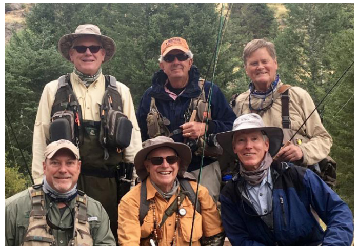
Rocky Mountain Flycasters in Rocky Mountain National Park