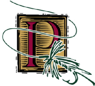
St. Peter's Fly Shop