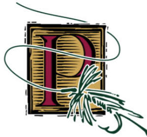
St. Peter's Fly Shop