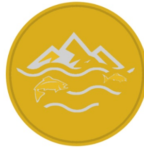
Gold (River Guardian) Donors ($5,000 - $9,999)