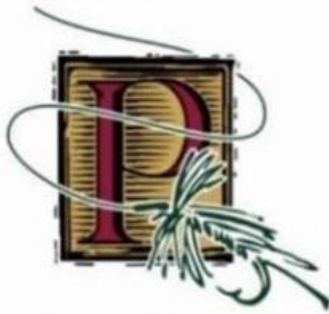
St. Peter's Fly Shop

Fort Collins, CO ph: 970-682-4704 web site: www.shesfly.com