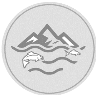
Platinum (River Champion) Donors ($10,000+)